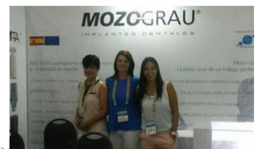
RP Dental crew in Colombia