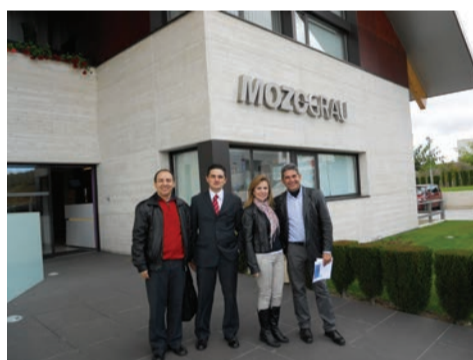
Drs from Colombia