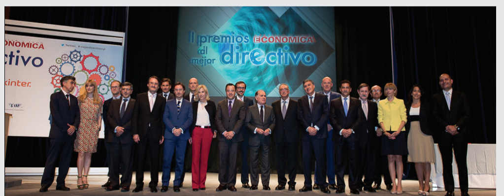
Winners of Best Director Awards 2014