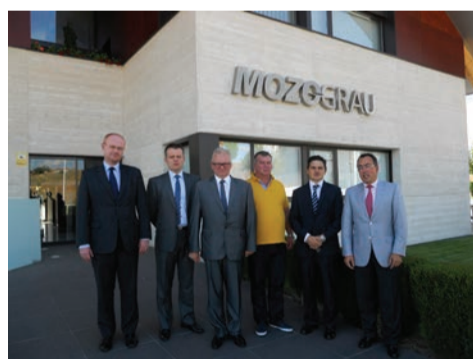
Drs from Poland