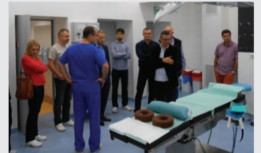
Surgery Department of the University of Warsaw