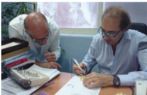
Italian's doctors in a Mozo-Grau training