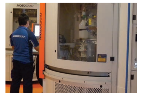
MG Bio-CAM System

Last October Mozo-Grau acquired a new milling machine which now allows us to cut metal into any complex shape required. It can reach up to 42,000 rpms and weighs 8,000 kg, both conditions being necessary for ensuring machine rigidity and high precision down to one ten thousandth of a millimetre (0.0001 mm). This machine operates using an open programme which can be used with any open scanner. This new addition allows our CAD-CAM Department to expand the product offering for the MG Bio-CAM, as we can now manufacture more structures, bridges and pillars that are completely tailored to our customers.