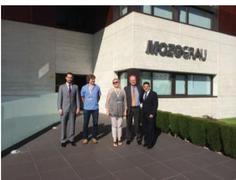
Drs from Poland