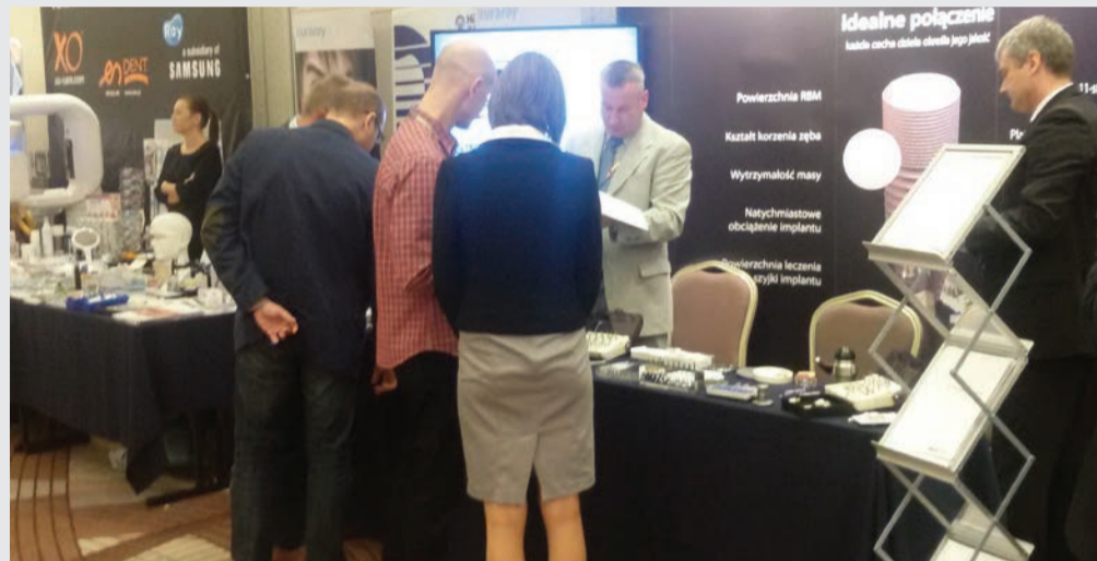
Quintessence Symposium in Warsaw

From 14-16 November of last year, Mozo-Grau Poland attended the Quintessence International Symposium in Warsaw. This scientific and commercial event is one of the most prestigious held in the country for the dental sector, with over 600 specialists in attendance. The Mozo-Grau stand attracted a great amount of interest from doctors looking for implant systems with scientific proof to endorse their products.