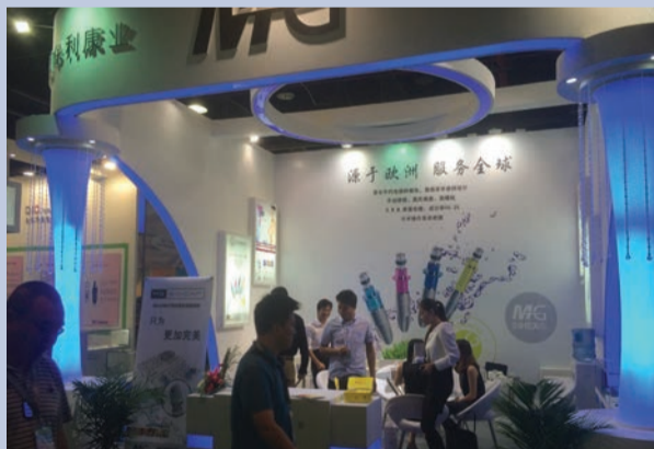
Mozo-Grau Stand Sino Dental Beijing 2014 Mozo-Grau在2014 中国国际口腔展