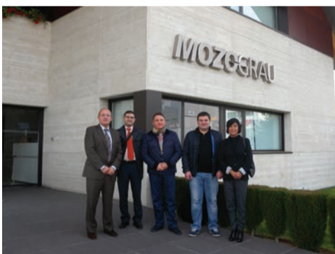
Drs from Russia