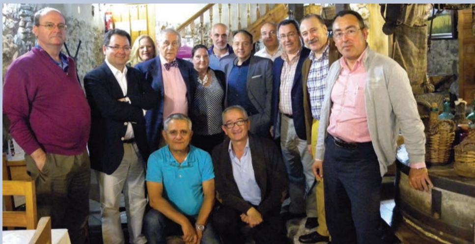
Some of the meeting attendees, Quintanilla 2014